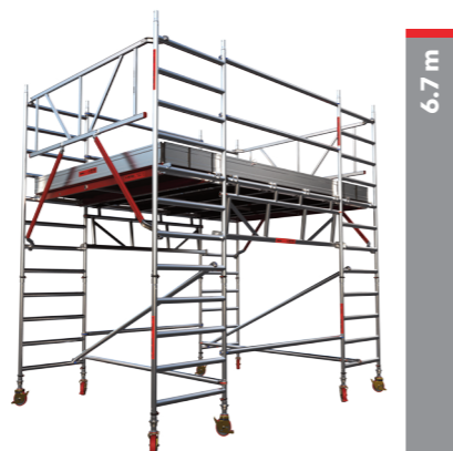
Bridge Quick Access Tower

This quick assembly alloy access tower provides a safe and convenient platform for working at heights up to 6 m. Choose from a one or two person tower, depending on your requirements.