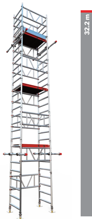
MiTower LiftShaft Alloy Access Tower

Choose the AGR option for added safety guardrails to protect the user/s further during build and use.