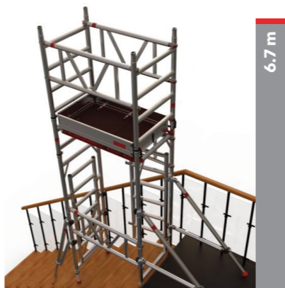
MiStairs Alloy Access Tower

MEP Hire's versatile and high quality Bridge Quick mobile tower offers a safe, yet speedy build, providing an incredibly stable working platform with a generous working area.