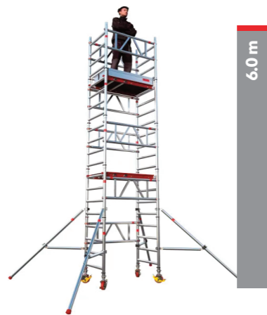
MiTower Alloy Access Tower

MEP Hire is an access specialist with a wide range of access towers suitable for different areas, ranging from working heights of 3.2-32.2m